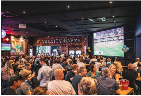
VARSITY BAR JOONDALUP