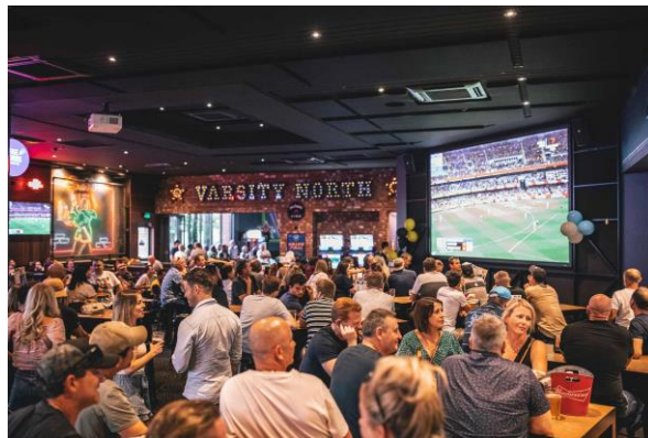
VARSIITY BAR JOONDALUP